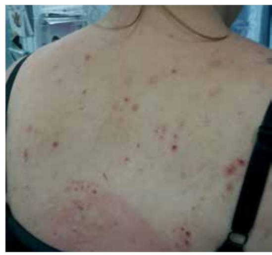
Impact of scratching

Given that women can be diagnosed with ICP as early as the first trimester, and that 20% of women will itch in pregnancy, some health professionals are concerned about over testing. There is no easy way to distinguish women who simply have pregnancy pruritus from those who have ICP, although the nocturnal nature of the itch in ICP may be a marker. It is possible that the combination of measuring the pruritic agents in conjunction with bile acids would be a better way of identifying women with ICP, but this needs further research and to be cost-effective. For now,